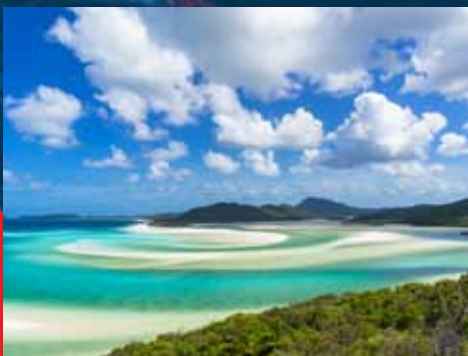
HILL INLET LOOKOUT