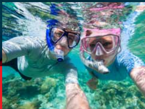
SNORKEL THE FRINGING GREAT BARRIER REEF