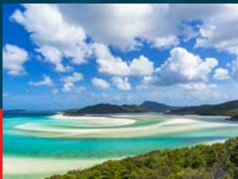
WHITEHAVEN BEACH & HILL INLET LOOKOUT