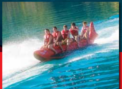
"RED SHARK" BANANA BOAT RIDES